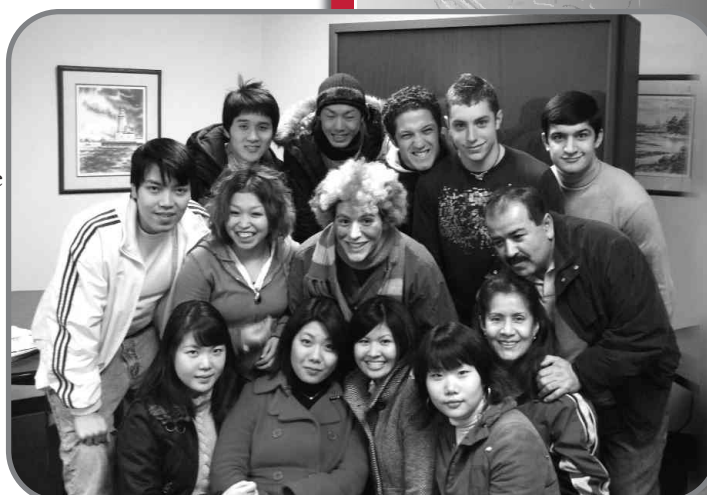
International Students prepare for a holiday program.