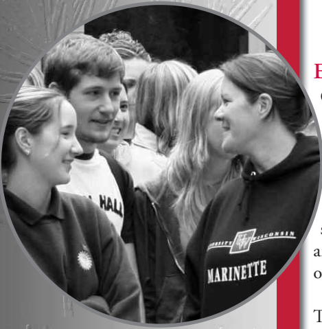
Students enjoy a cook-out on the Schmidtke Terrace at the End-of-the-Year Bash in May.