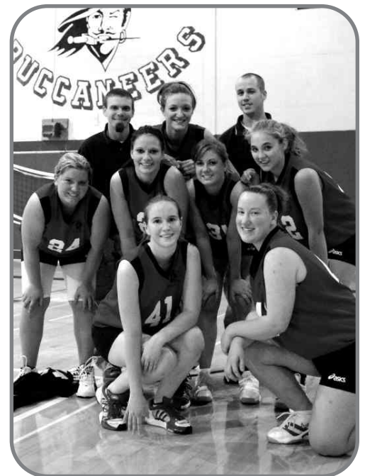
Region II Champions for 2006 The UW-Marquette Lady Bucs