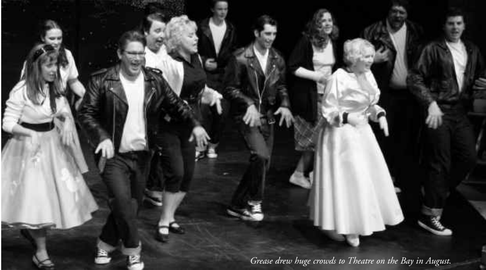
Grease drew huge crowds to Theatre on the Bay in August.