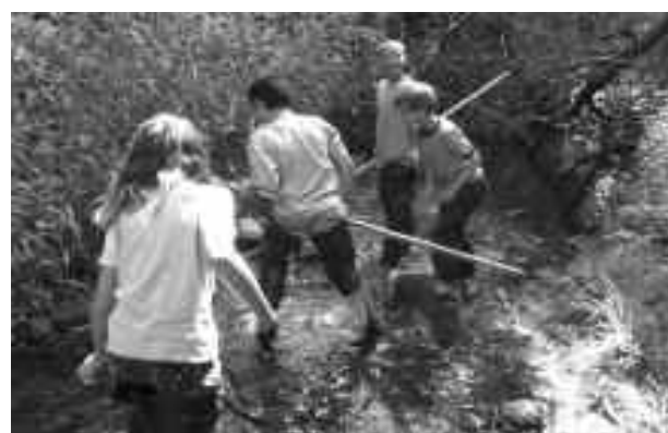
College 4 Kids students look for invertebrates in the creek that runs through the campus into the bay in July.