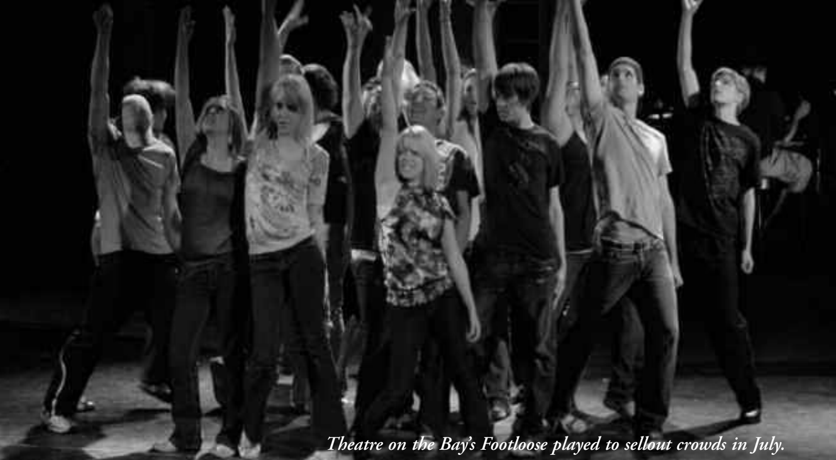
Theatre on the Bay's Footloose played to sellout crowds in July.