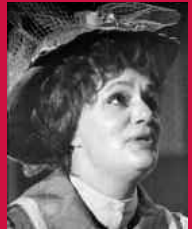
Hello Dolly 1986