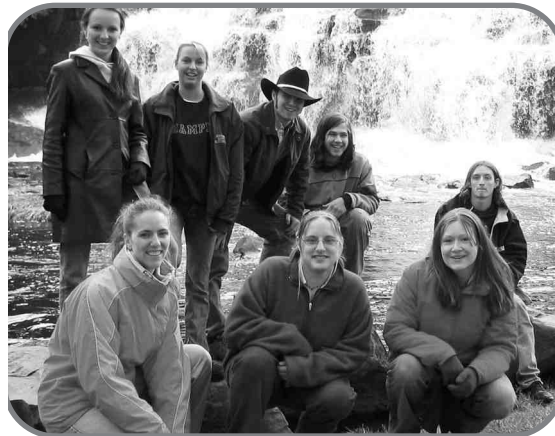
Students from the BIO 250 class visited Bond Falls and other Upper Peninsula wonders in the spring.

Engaging students in the First Year (ESFY) is a UW Colleges'-wide effort that focuses on first year students as they make the transition from high school or post high school experiences to college. UW-Marquette's ESFY program "Intro to College" focuses on engaging students in activities geared toward enhancing academic and life skills. This year a campus-wide learning experience based on the fall Theatre on the Bay production, The Night Thoreau Spent in Jail , included classes from English, Ecology, Philosophy, Speech, Theatre, History, a Learning Community, and Intro to College.