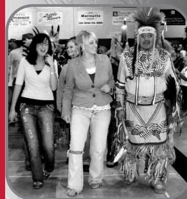
UW-Marinette Students join Pow Wow Dancers at the Fall Convocation.