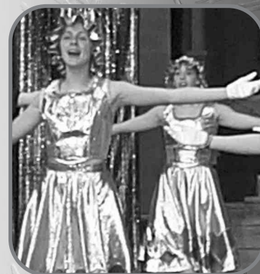
The chorus from Disney's Beauty and the Beast