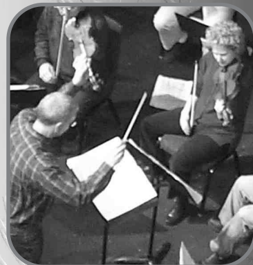
The Bay Shore Orchestra rehearses for a concert.