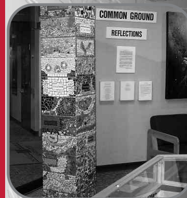
Some of the exhibits at the Common Ground Art Show in the UW-Marinette Gallery.