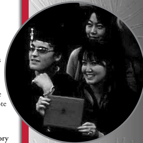
International students at graduation in May.